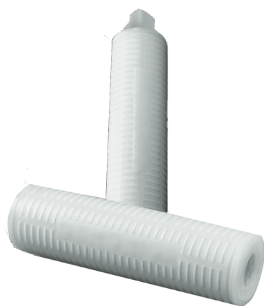
Figure 1: Memtrex PC Filters